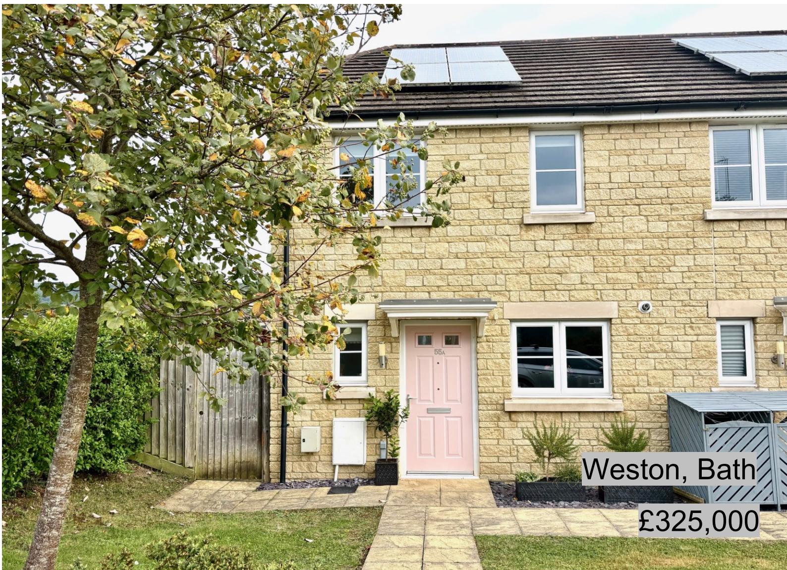
Two Double Bedroom End Terrace. Large Plot & Extensive Gardens. EPC Grade B